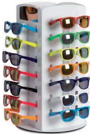
A92166 For 28 pcs