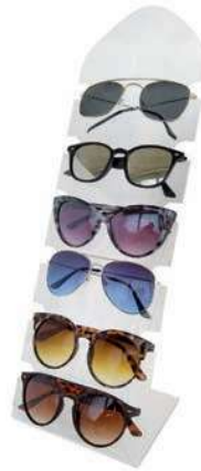
A94000 For 6 pcs