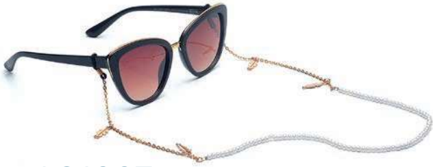
A91007 Sunglasses chain