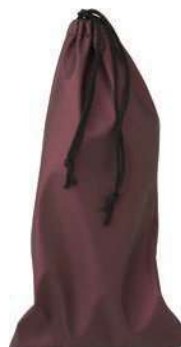
A90017 Big size