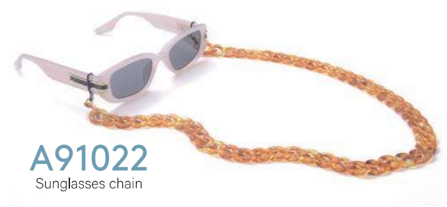
A91022 Sunglasses chain