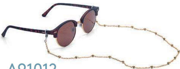
A91012 Sunglasses chain