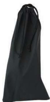
A90016 Big size