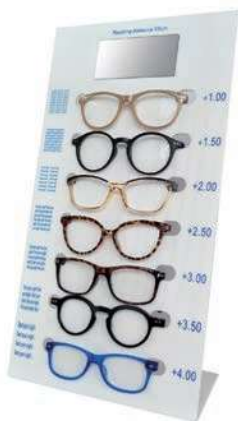
A94002 For 7 pcs with reading test