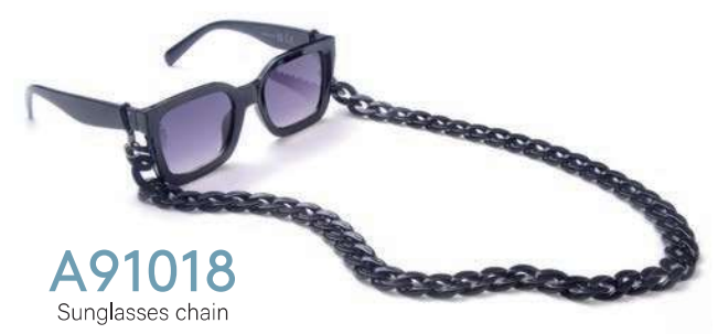
A91018 Sunglasses chain