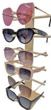
A94011 For 6 pcs