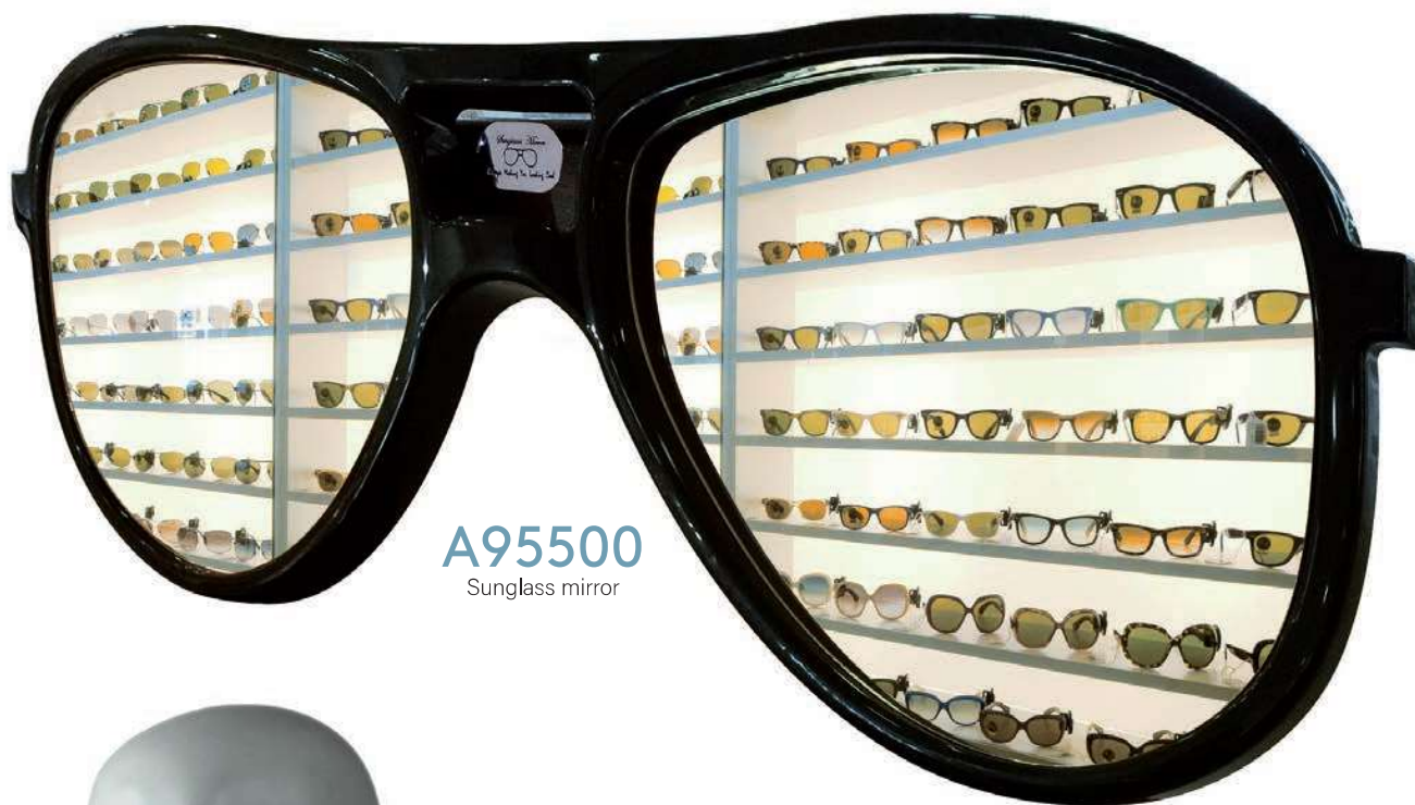
A95500 Sunglass mirror