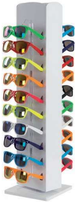
A92164 For 20 pcs