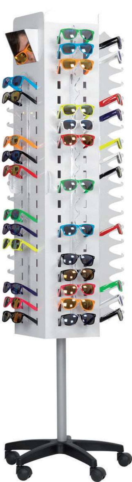
A92161 For 100 pcs