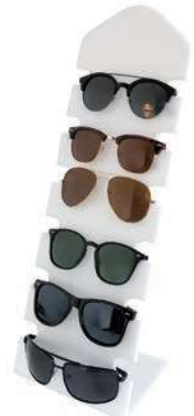
A94001 For 6 pcs