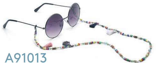
A91013 Sunglasses chain