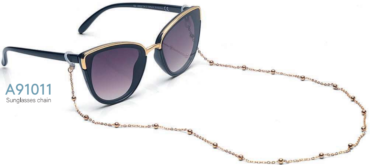
A91011 Sunglasses chain