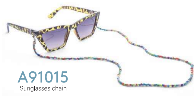
A91015 Sunglasses chain