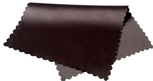
A91100 Cleaning cloth