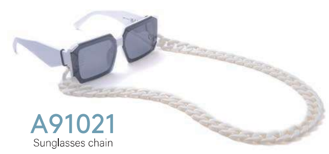
A91021 Sunglasses chain