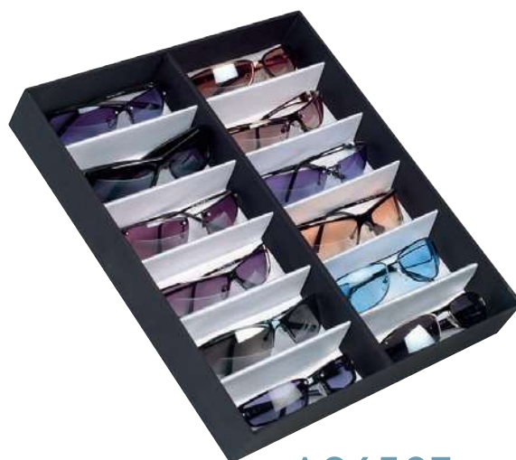
A96503 For 12 pcs