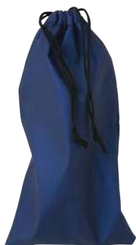
A90015 Big size