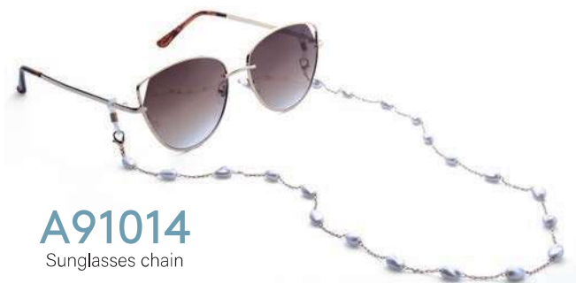
A91014 Sunglasses chain