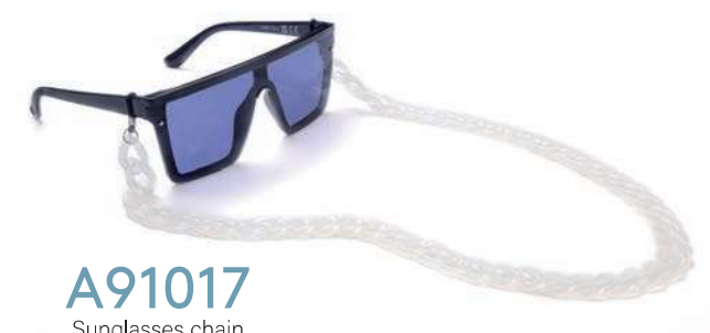
A91017 Sunglasses chain