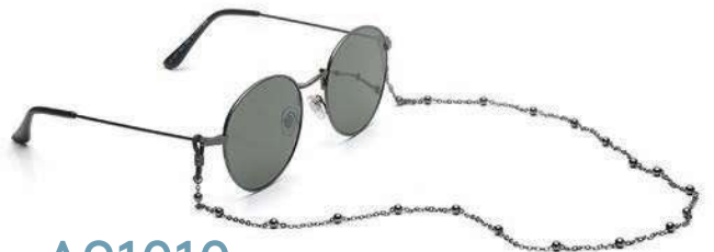
A91010 Sunglasses chain