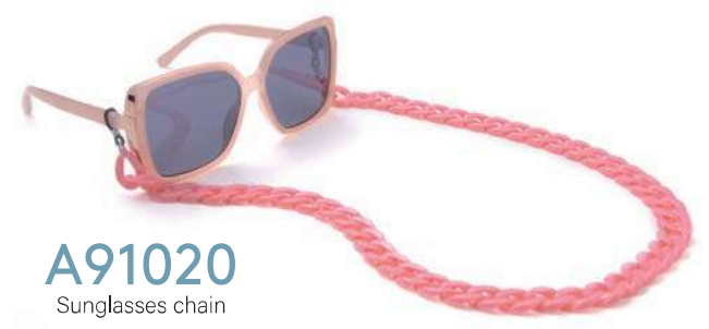
A91020 Sunglasses chain