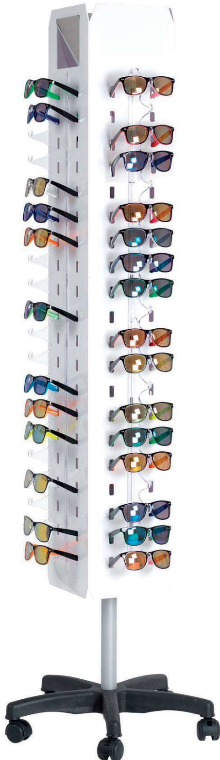
A92162 For 80 pcs