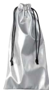
A90018 Big size