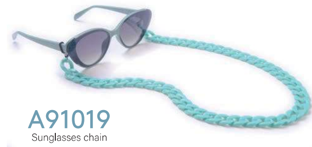
A91019 Sunglasses chain