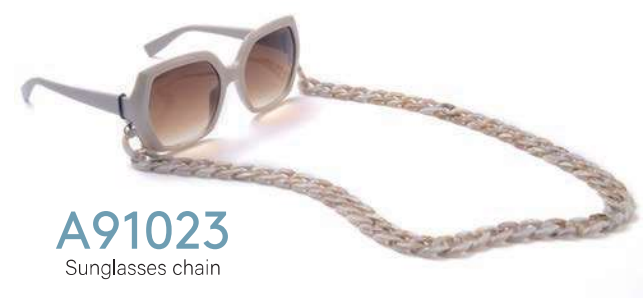
A91023 Sunglasses chain