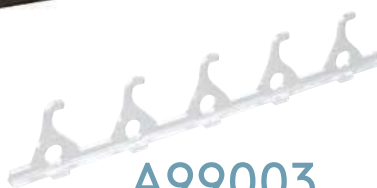
A99003 Nose hooks