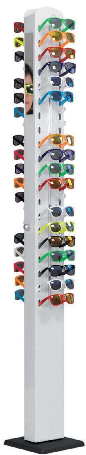
A92163 For 40 pcs