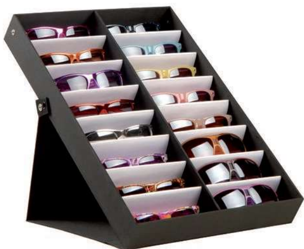
A96505 For 16 pcs