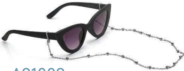
A91009 Sunglasses chain