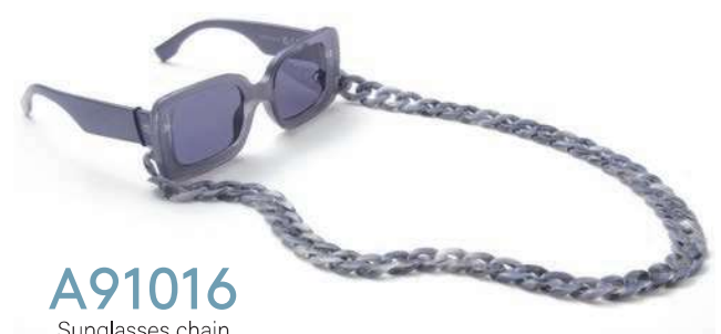
A91016 Sunglasses chain